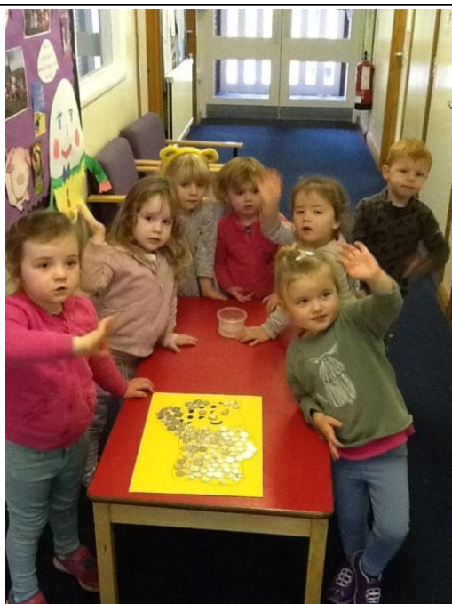
Some of the children in Little Roots @ Stoke 'covering' Pudsey