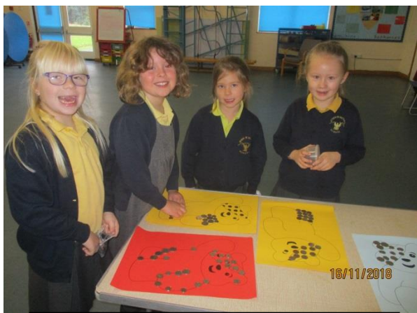
Some of the children in Acorns Class 'covering' Pudsey in silver