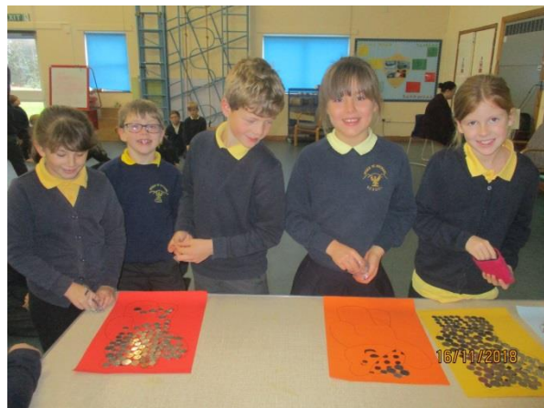
Some of the children in Oaks Class 'covering' Pudsey in silver