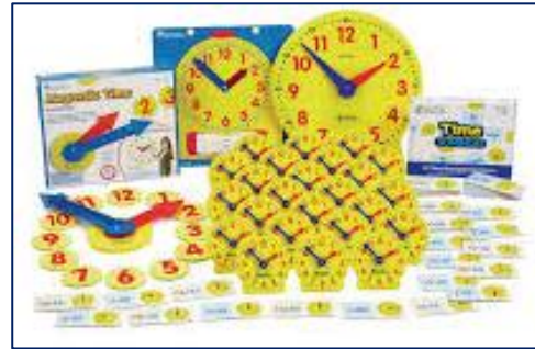
Learning Clock Kit