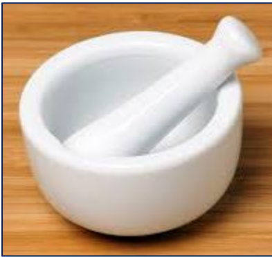
Pestle and Mortar